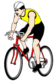
2006 Bicycle Crash Information