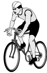
2005 Bicycle Crash Information